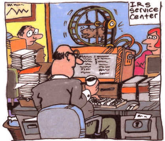
#3 Outdated Software