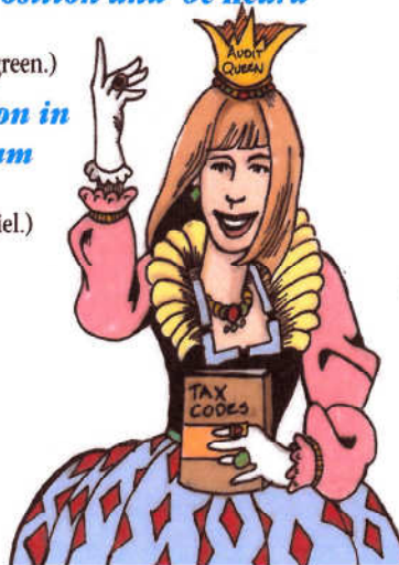
#4 Ruling the Audit Scene