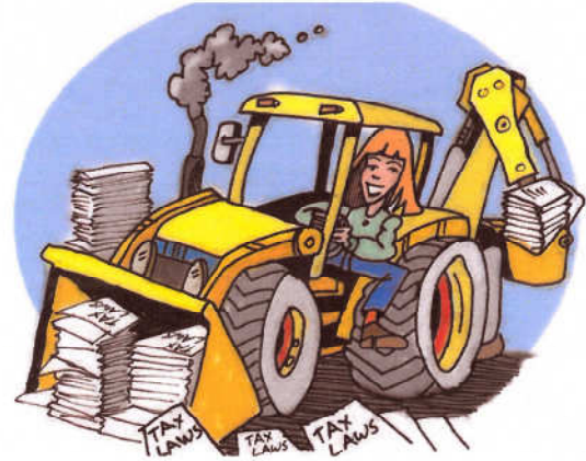
#2 Confusing Tax Laws